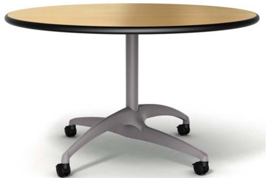
Item T2: Coalesse Mobile Round Table, 30"D (can be used for extra work space)