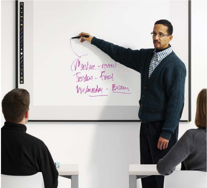
Item WB1: Steelcase Eno Interactive Whiteboard