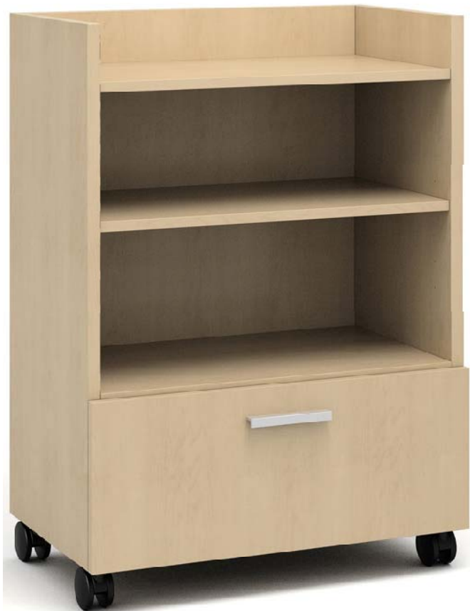
Item T1: Turnstone Currency Mobile Cart