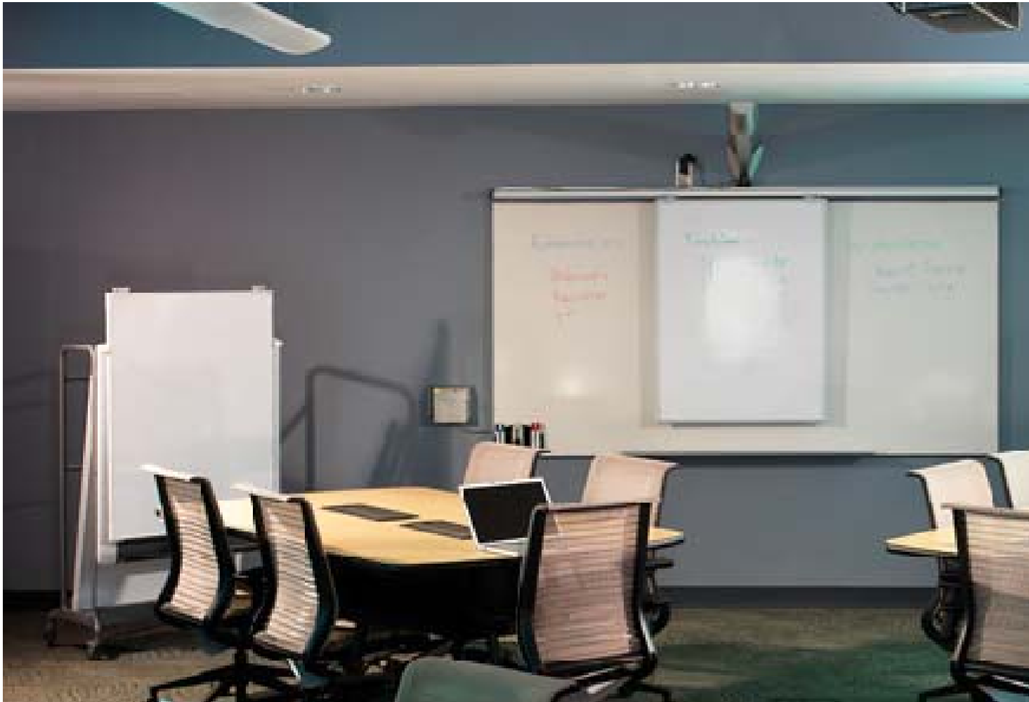
Steelcase CopyCam (Item CC1) and Whiteboard (Item WB2) shown with Rail Track (Item WB3) and Huddleboard/Mobile Stand (Item WB4)