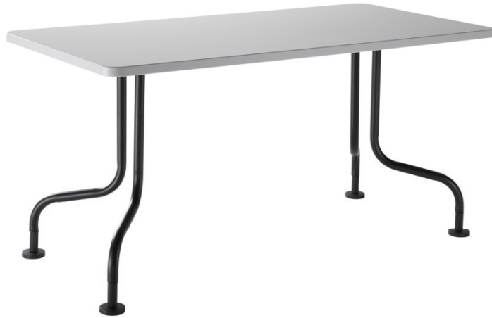
Item T3: Turnstone Groupwork Tables (available with or without casters)