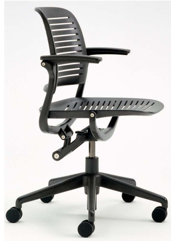
Item S1: Steelcase Cachet Chair (arms can be flipped up for an armless version)