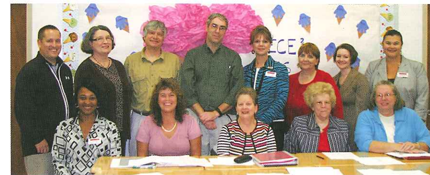
Teacher Education Faculty work together to prepare outstanding teachers for South Carolina Schools.

FOR FRIENDS OF THE NEWBERRY COLLEGE TEACHER EDUCATION PROGRAM